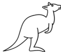
a n g a r o o