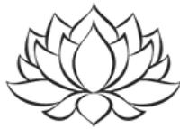
o t u s