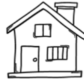
o u s e