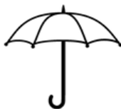
m b r e l l a