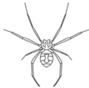
n i d e r