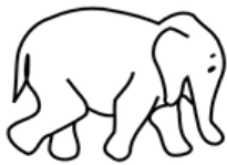
l e p h a n t

The first letter is missing from the names of the objects given below. Fill in the right letters in the blank spaces.