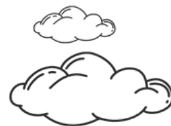
l o u d