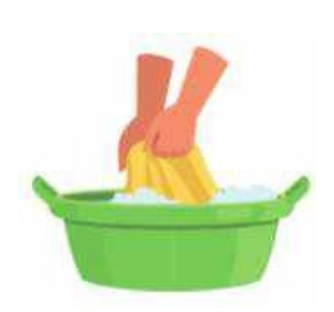
For washing clothes.