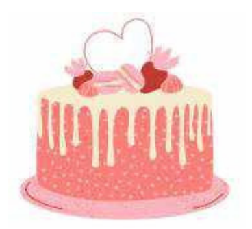
For baking and cooking.