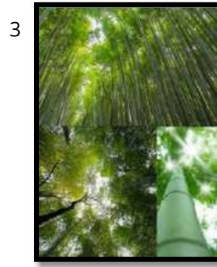
Sagano Bamboo fores