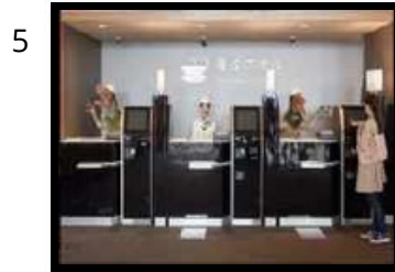
Henn- Na hotel