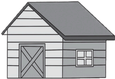
Shed or Barn

Help Mini and her brother take each animal to their correct shelters by drawing a line from the animal to its shelter. Here is the twist! Make sure that the lines don't touch each other.