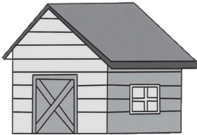
Shed or Barn

Help Mini and her brother take each animal to their correct shelters by drawing a line from the animal to its shelter. Here is the twist! Make sure that the lines don't touch each other.