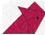
3. Do the same for the other corner.